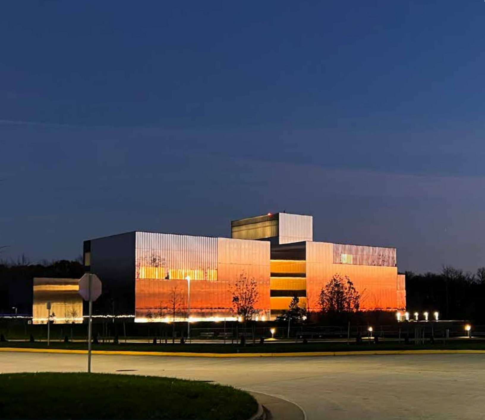
Photo credits: National Museum of the United States Army. Special thanks to photographers Duane Lempke and Scott Metzler.

National Museum of the United States Army